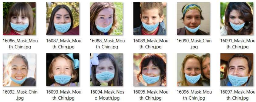
Fig. 3. This figure is sample dataset of class incorrectly mask that the person wears a mask but it not properly (1,918 images).