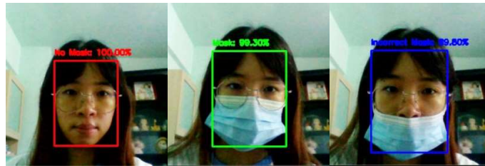
Fig. 6. The result will be show at the screen as a rectangle frame that detect a face, text, and percentage of confidence degree.

The accuracy in this project by using MobileNet V2 model is about 0.958 when the number of complete passes through the training dataset or Epochs equals 10.