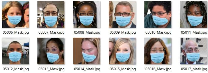
Fig. 2. This figure is sample dataset of class correct mask that the person wears a mask properly (1,994 images).