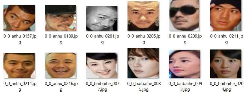
Fig. 1. This figure is sample dataset of class without mask that the person does not wears a mask (1,918 images).