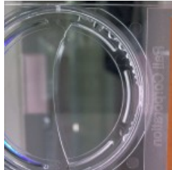
DI WATER NO SEEDS