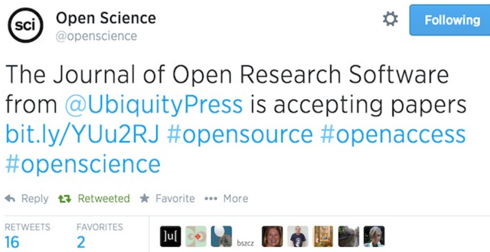
Figure 2 Screenshot of a tweet sent by the @openscience announcing JORS call for papers.

On 2013-03-29, the tweet represented in Figure 2 was posted by the @openscience Twitter account.