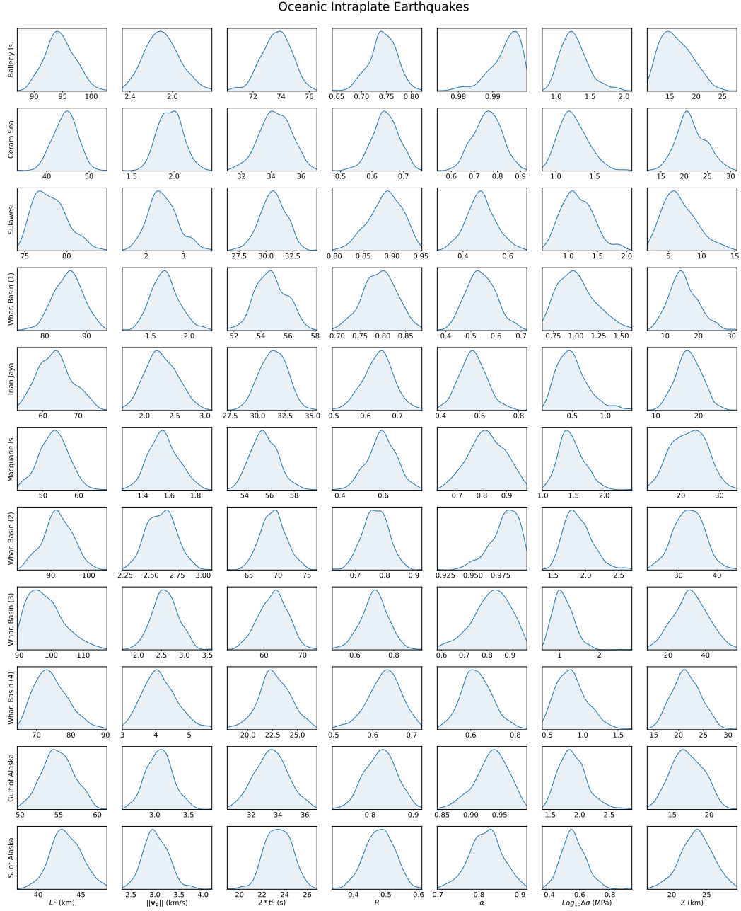
Figure S3. Ensembles of parameters defined in equations 4 and 5 of the main text for the oceanic intraplate earthquakes considered in this study.