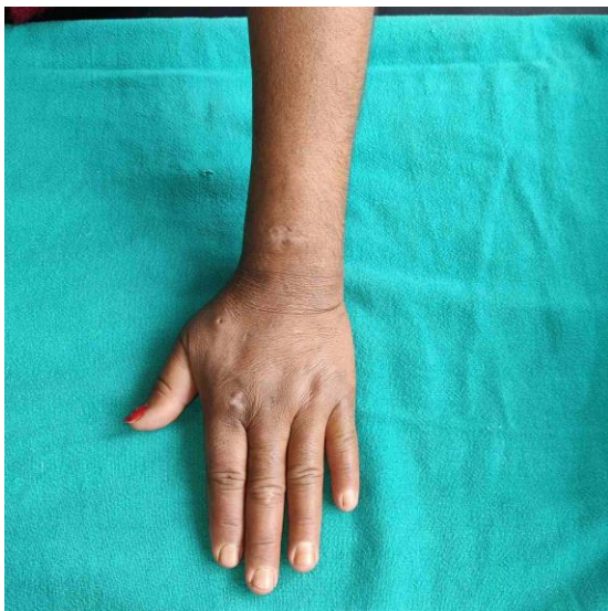
Fig 3: Complete resolution of lesions at 6 months of Clarithromycin, ethambutol and doxycycline