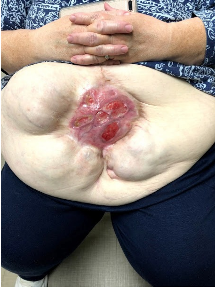
Figure 1. A. 9 cm x 9 cm scar with multiple ulcerated lesions on the anterior supra-umbilical region)