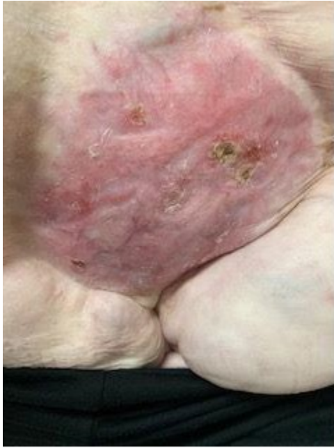
C. 1 month following losartan discontinuation.