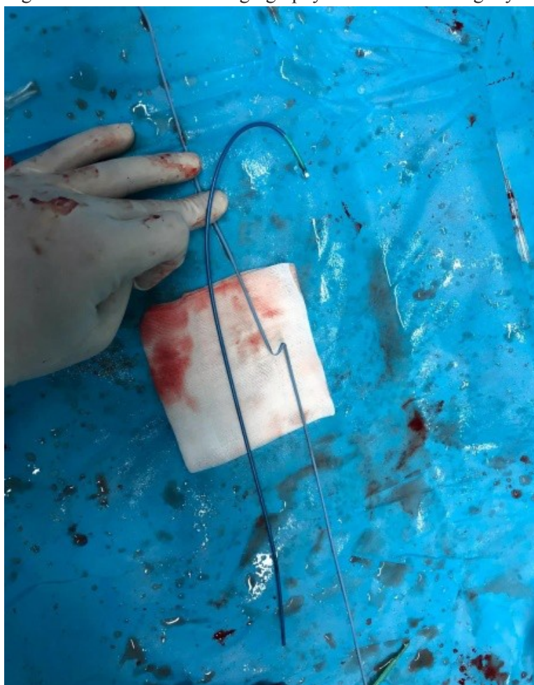
Fig.5 The knotted catheter was pulled out successfully.