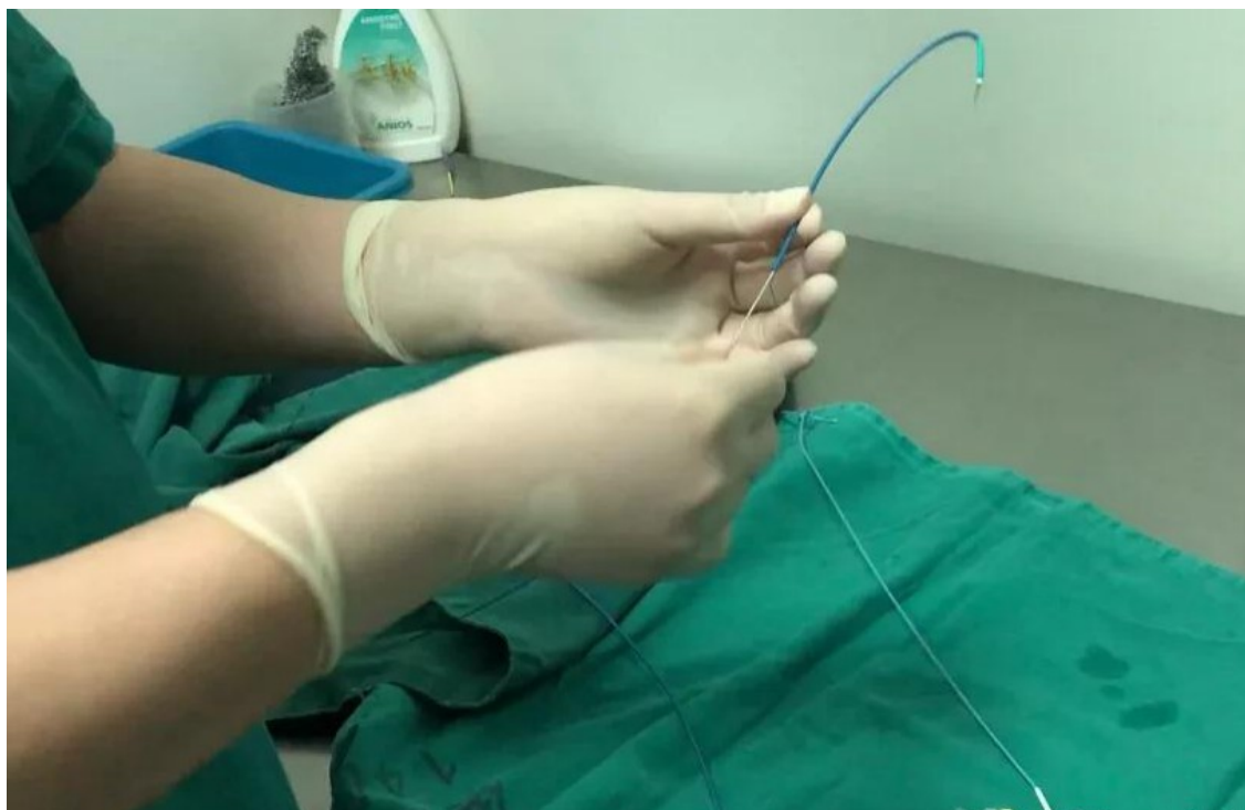
Fig.2 A balloon passed through the cut guiding catheter from tail to tip.