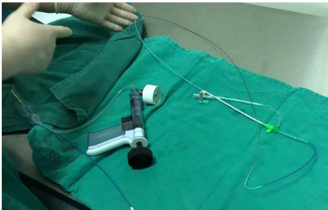
Fig.4 The balloon and the angiography catheter contact tightly.