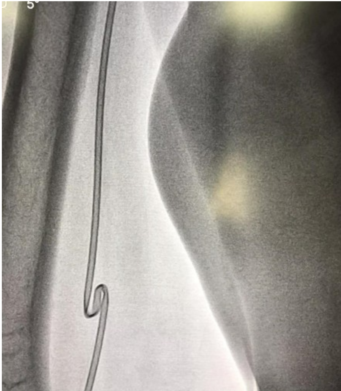
Fig. 1 It revealed an outright knot within right brachial artery with fluoroscopy.