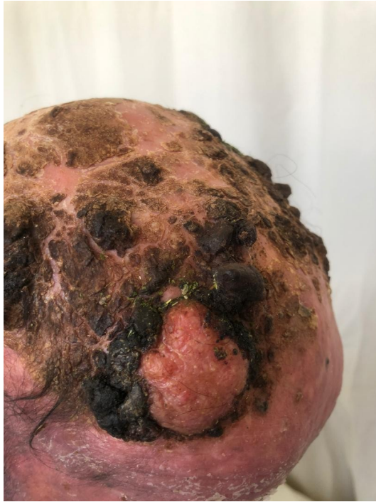
Figure 3: Multiple tumoral lesions present over the scalp including a 6 x 5 cm erythematous, firm and adherent lesion over the frontal part