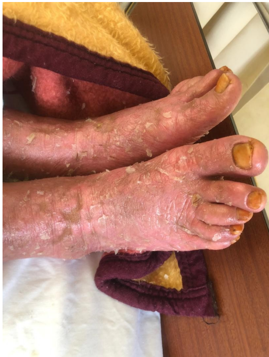
.Figure 2: Dorsal aspect of both feet showing erythematous scaly skin