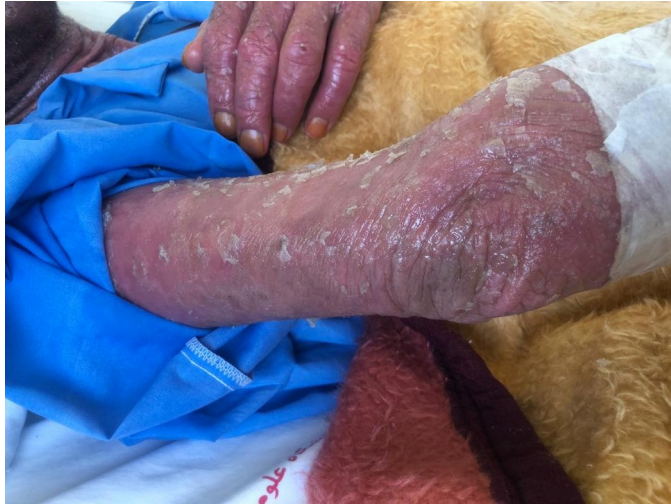
.Figure 1: Extensor aspect of the right arm showing erythematous scaly skin