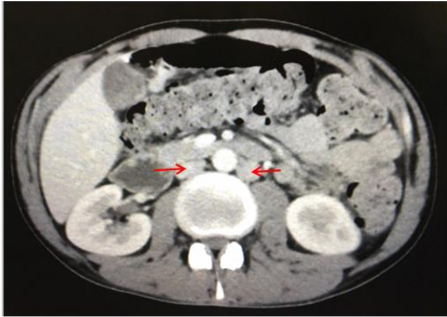
Figure 1: CT scan (sagittal plane): Duplication of the inferior vena cava