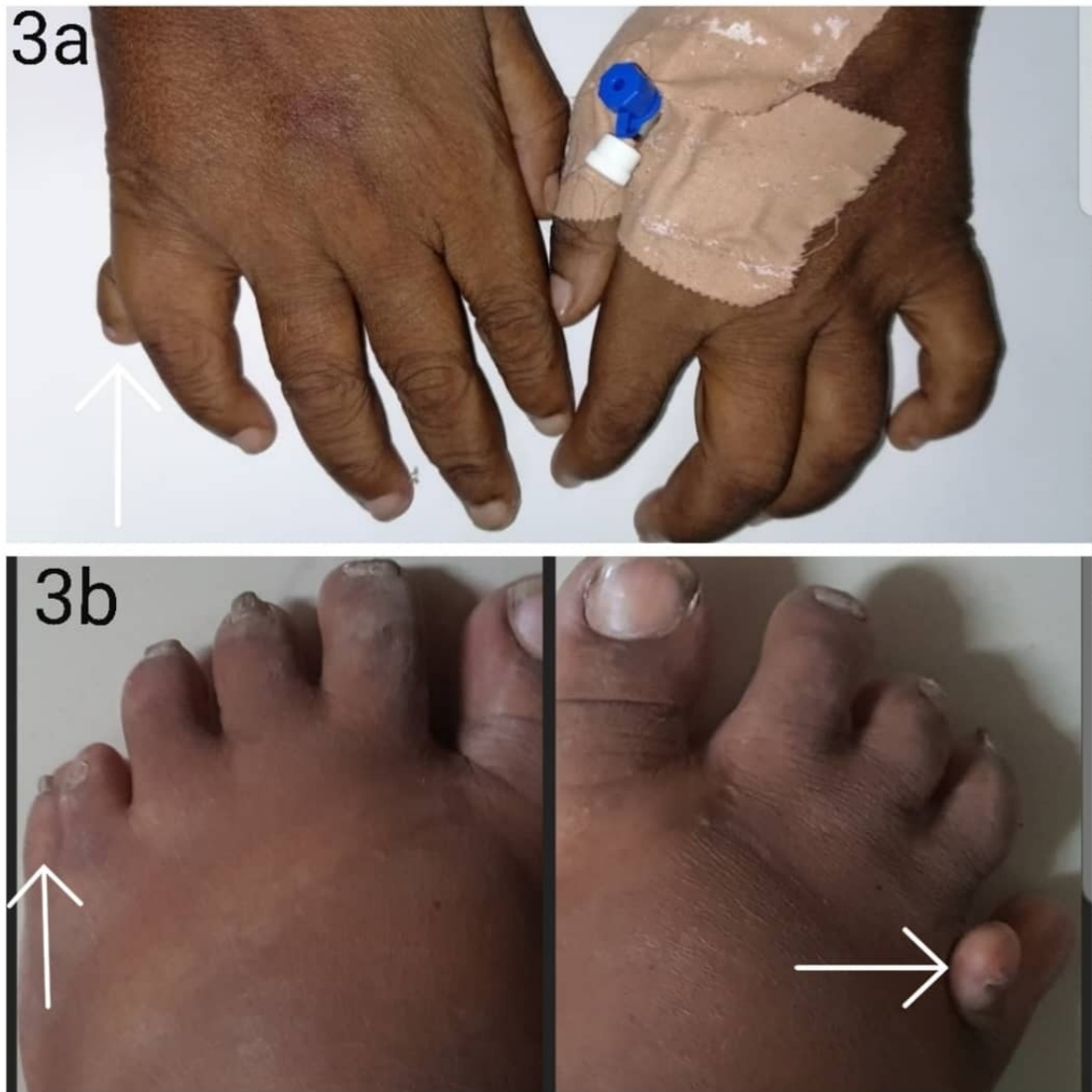
Figure 3: 3a right upper limb postaxial polydactyly, 3b lower limb postaxial polydactyly.