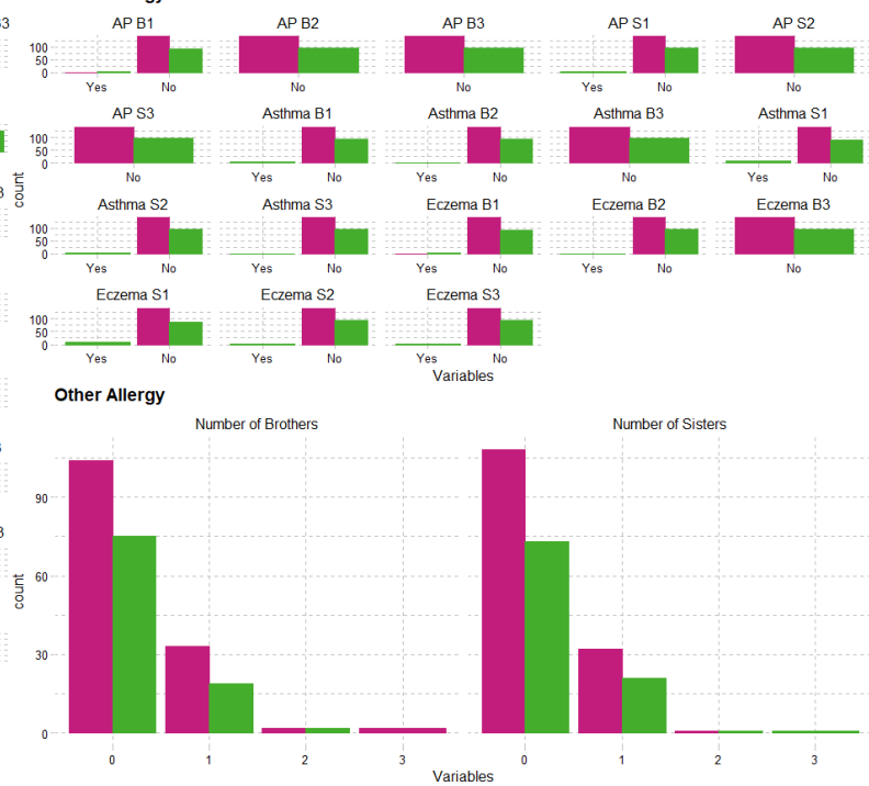
Figure 1 c