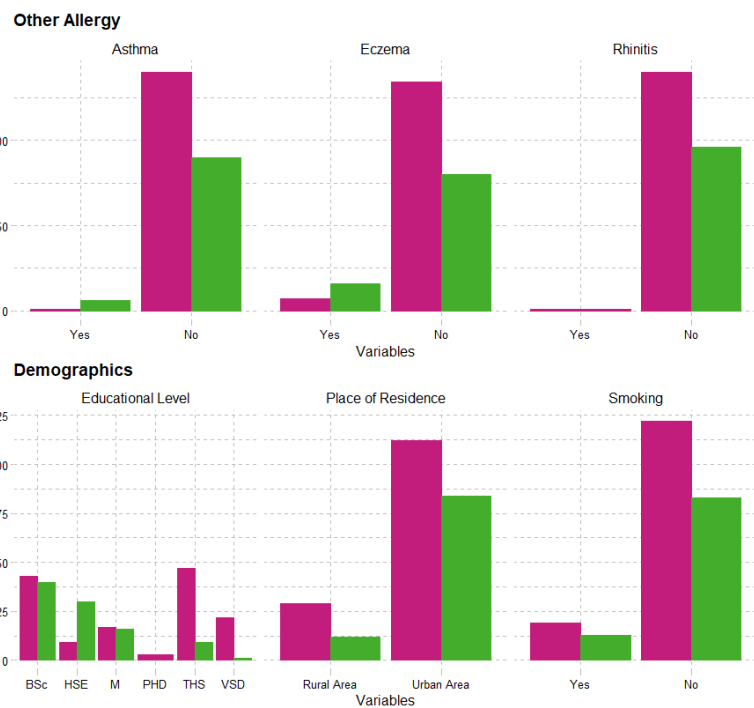
Figure 1 b