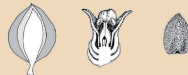
— A. m. australasica

Calyx lobes mostly pubescent. Bark rough fissured. Corolla width 3-7mm. Style intermediate.