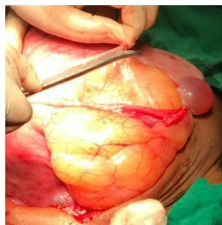
FIGURE NO. 5- LOWER POLE OF THE KIDNEY