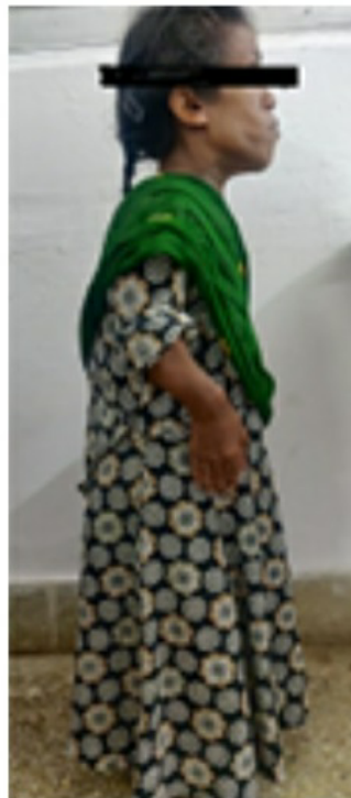
FIGURE NO . 4