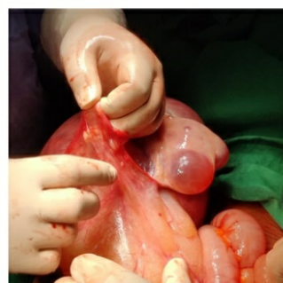
FIGURE NO. 6 MULTIPLE CYSTIC OVARY