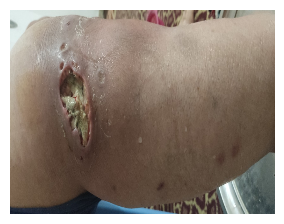
Figure 1 . A mucopurulen painful and ulcerated lesion of right sided foot with irregular borders compatible with pyoderma gangrenosum.

The authors declare that they have no competing interests.