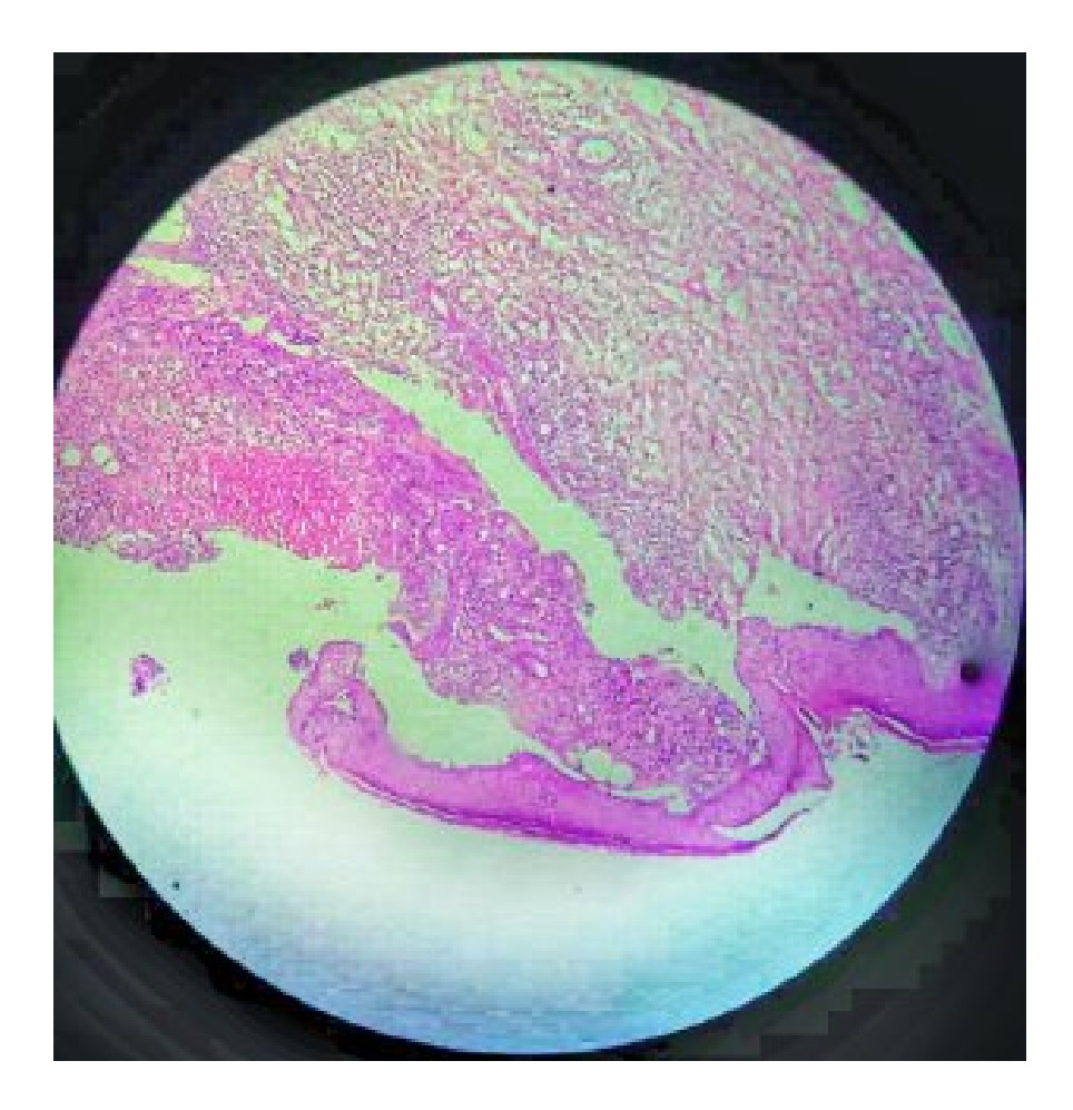
Figure 2. A Microscopic view (histologic) of bar-shaped skin with subcutaneous tissue (H&E, \times 10 ) showed hyperkeratosis, and acanthosis, associated with superficial dermal fibrosis and intradermal neutrophilic abscess formation.