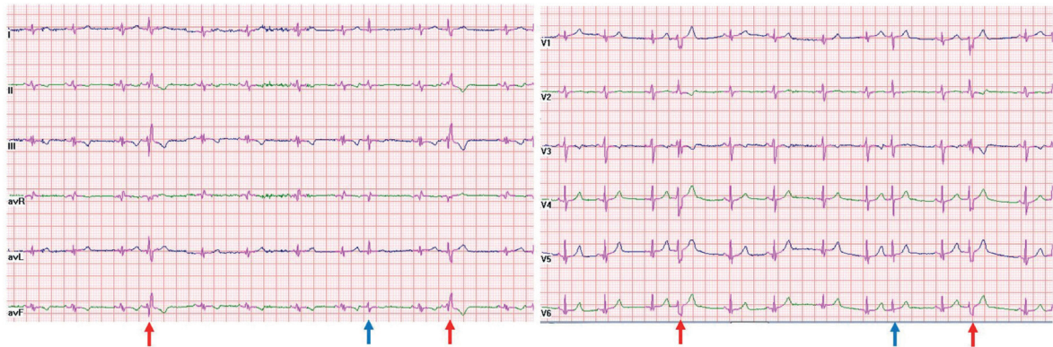
Fig. 2. Supraventricular extrasystoles with (red arrow) and without (blue arrow) aberration detected during 24-hour ECG.

suggestive of connective tissue disease, a diagnosis of isolated mitral valve aneurysm (MVA) was considered in the patient. The patient was asymptomatic and we decided on close clinical follow-up without any medication. During the 10-month follow up period the patient had no complaints and no complications were observed. The patient was planned to be followed up with echocardiography every 6 months and annual 24-hour Holter ECG. Written informed consent was received from the parents of the patient.