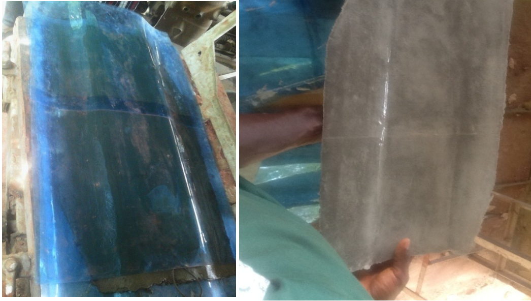
Plate 1: Slurry on corrugated mould Plate 2: Roofing tiles produced Covered with polythene ready for drying.