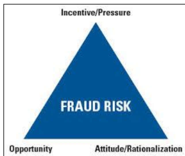
Fig 1: Role of employee and management in Data integrity

Warning Letter and Compliance Issue: The risks of non-compliance increase with the number of NDAs/ANDAs and facilities, as increased scrutiny comes with scale and regulatory authorities are willing to send warnings to multiple sites based on the review of one site. A pharmaceutical manufacturer's lever to pull to reduce the risk of regulatory action is in improving Data Integrity. Doing so may provide a sustainable advantage in a highly competitive market [2] .