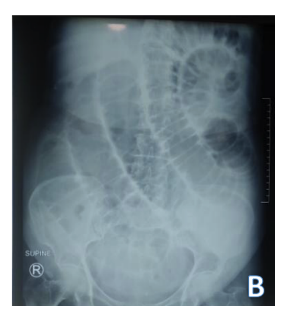
Figure 1. Plain abdominal X-ray: (A) Multiple air-fluid levels visible in the small bowel loop in in erect view; (B)Prominent dilated small bowel loops seen in supine view

Ultrasonography of the abdomen and pelvis was unremarkable with minimal free fluid in the pelvis. Urgent Contrast Enhanced Computed Tomography (CECT) scan was performed which confirmed collection of fluid in the right iliac fossa, pelvis and along the anterior surface of the liver. It was however unremarkable and no specific findings were documented supportive of mesenteric ischemia. Despite aggressive fluid management, analgesics and intravenous antibiotics, the condition of the patient did not improve. Hence, the patient underwent emergent laparotomy. Intraoperatively, greenish fluid and gangrenous small bowel starting from 20 cm distal to the duodenojejunal flexure to 15 cm proximal from the Ileocolic junction was seen (Figure 2). Tissue decay with blackish discoloration of the intestine was found which is suggestive of AMI. Resection of the gangrenous segment of the bowel with double barrel loop ileostomy was performed.