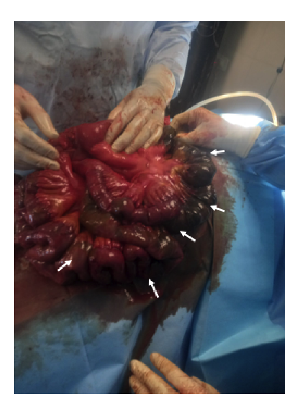
Figure 2. Gangrenous bowel segments (white arrows) seen intraoperatively.

The patient was then shifted to the COVID surgical intensive care unit (ICU) without extubating. She received Meropenem IV 1gm and Vancomycin IV 500 mg twice daily along with low molecular weight Heparin 60 mg twice daily the following day.