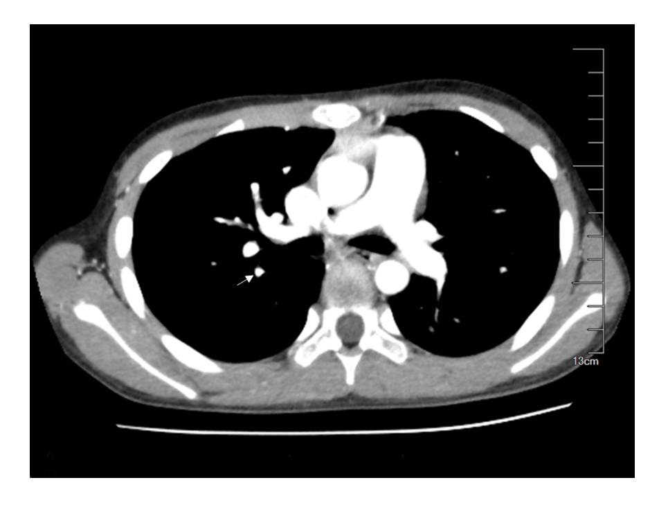
Figure1: Image changes of chest contrast-enhanced CT on the 4th day of admission and 1-month follow-up after discharge. A B Red arrow pointed pulmonary emboli. C D Pulmonary emboli disappeared at the same positon.