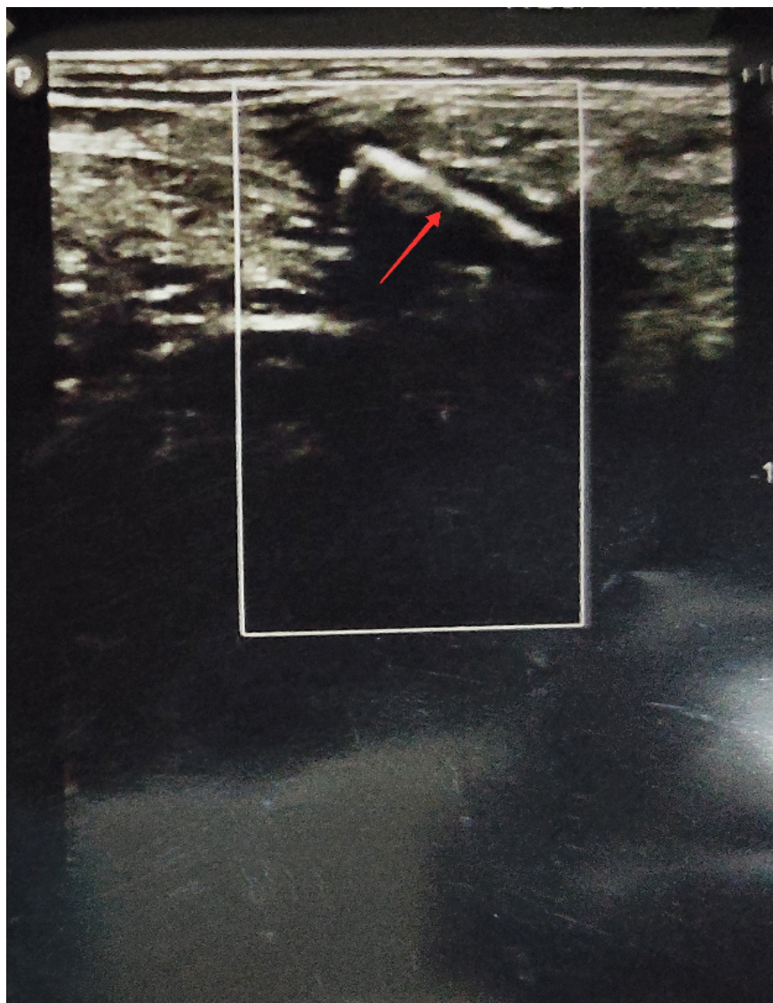
Figure 1: Ultrasonography of Abdomen showing mixed echoic lesion in Right iliac fossa.