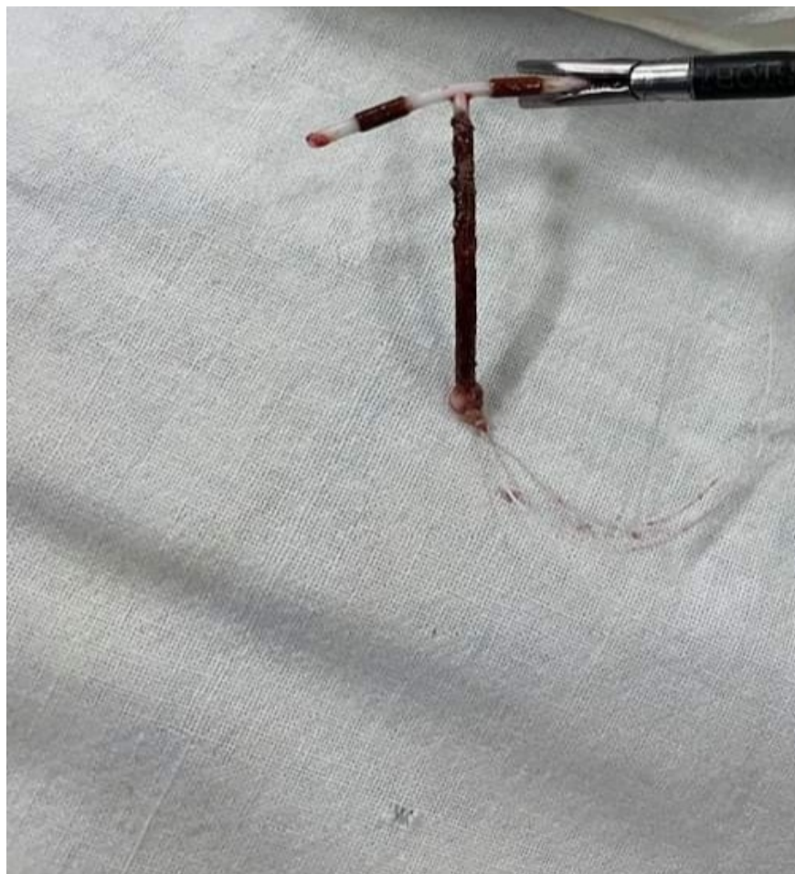
Figure 3: Copper IUCD after laparoscopic removal.