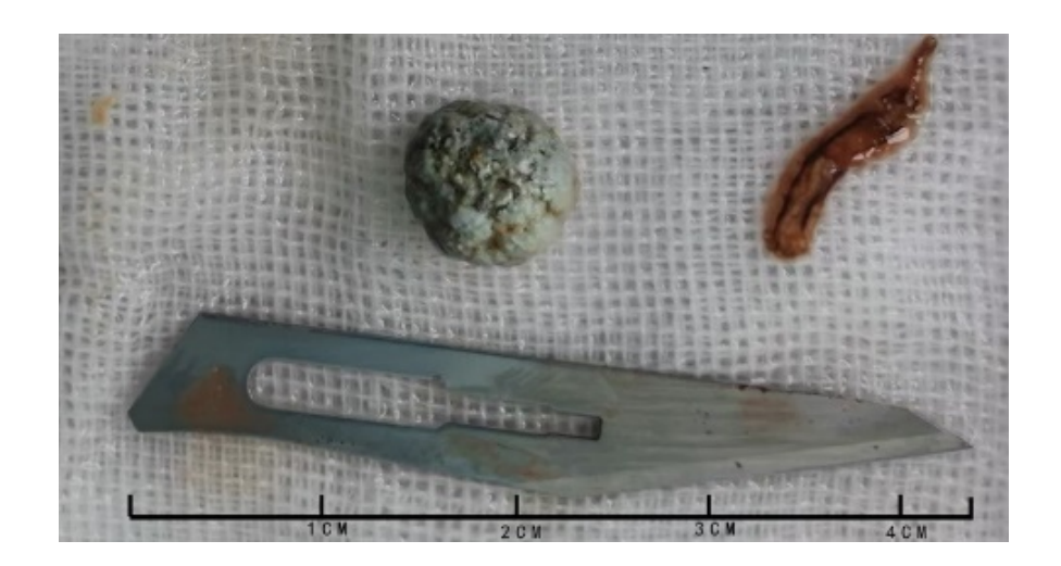
Figure 2 An active parasite and a stone found upon surgical exploration of the common bile duct.