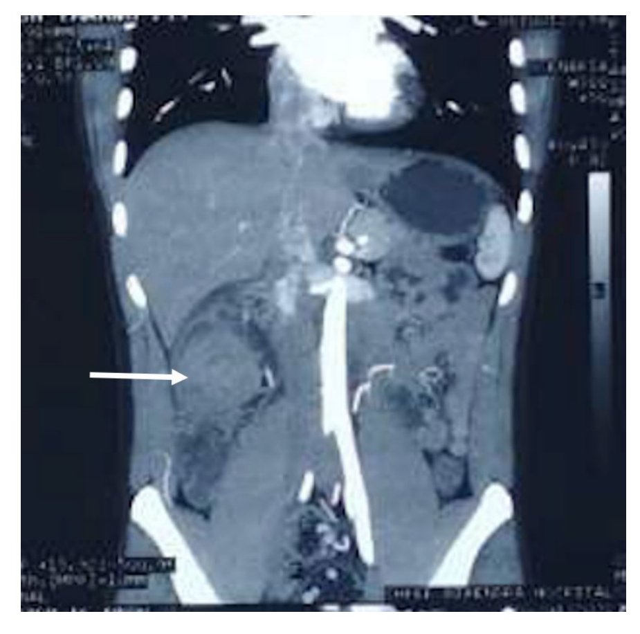
Figure 1: Contrast Enhanced Computed Tomography (CECT) of the abdomen showing mesenteric hematoma in right iliac fossa.