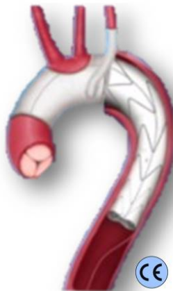
Straight 2 E-VITA NEO