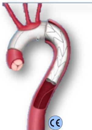
Straight 1 E-VITA NEO