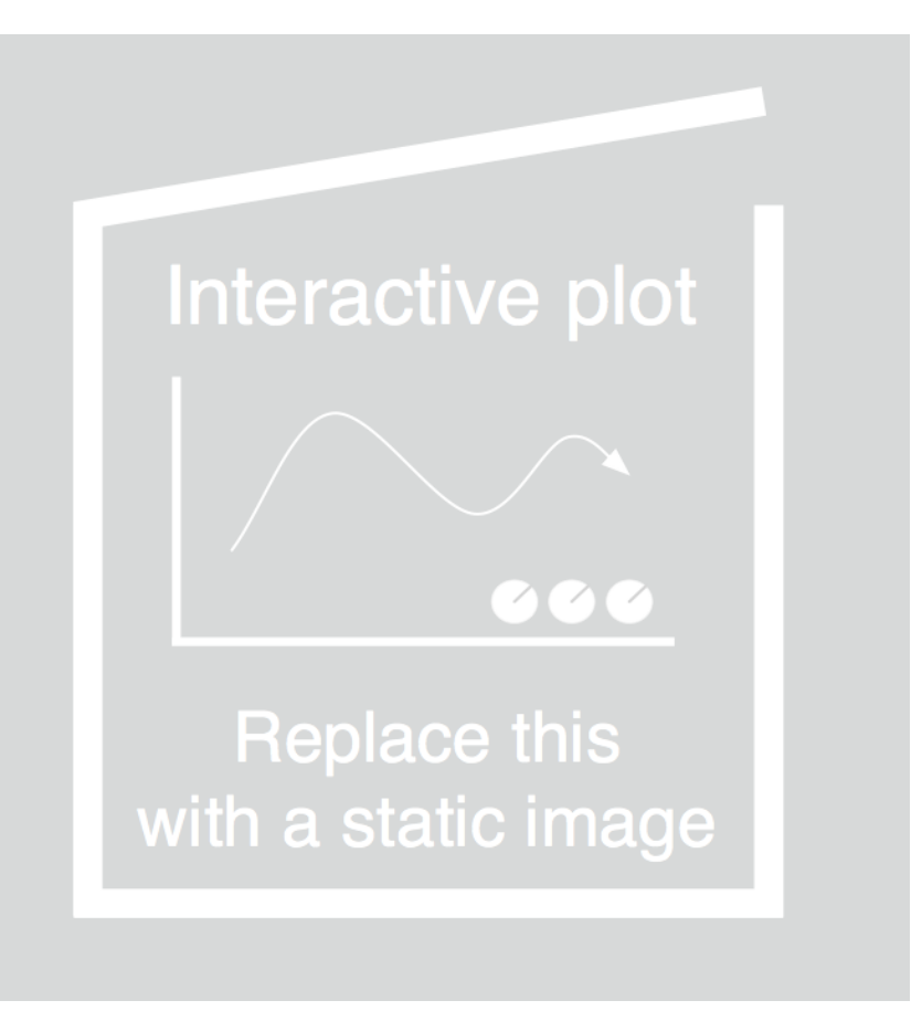
Figure 11: Number of submitted articles per NIH subdomain for Oncology and Radiotherapy.