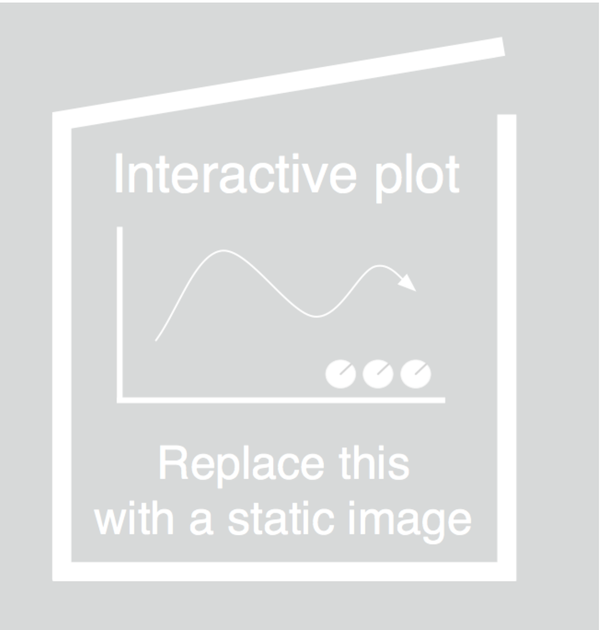
Figure 9: Number of submitted articles per NIH subdomain (e.g., "nda" corresponds to "nda.nih.gov") per WOL Level 1 category.