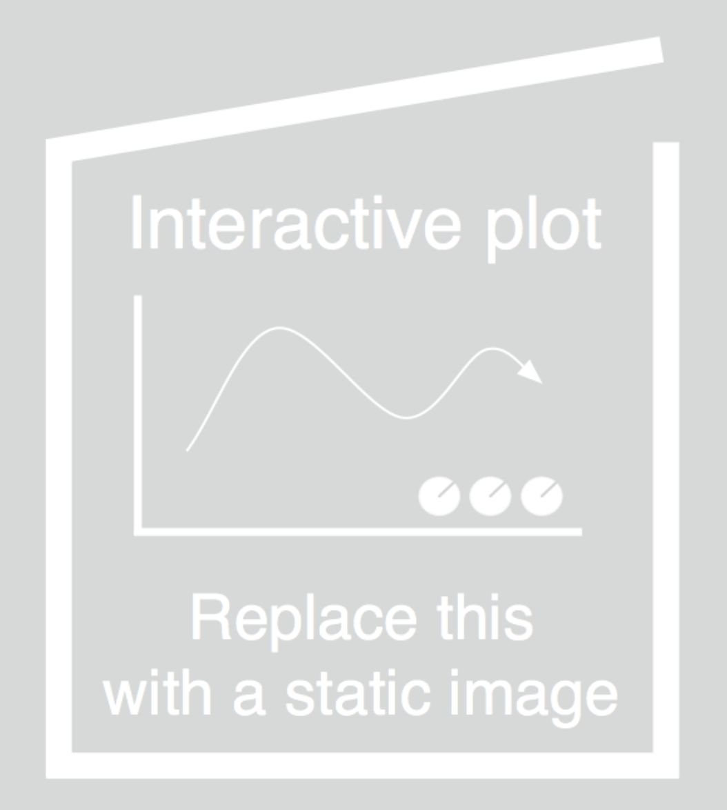
Figure 3: Top domains found within DASs analyzed