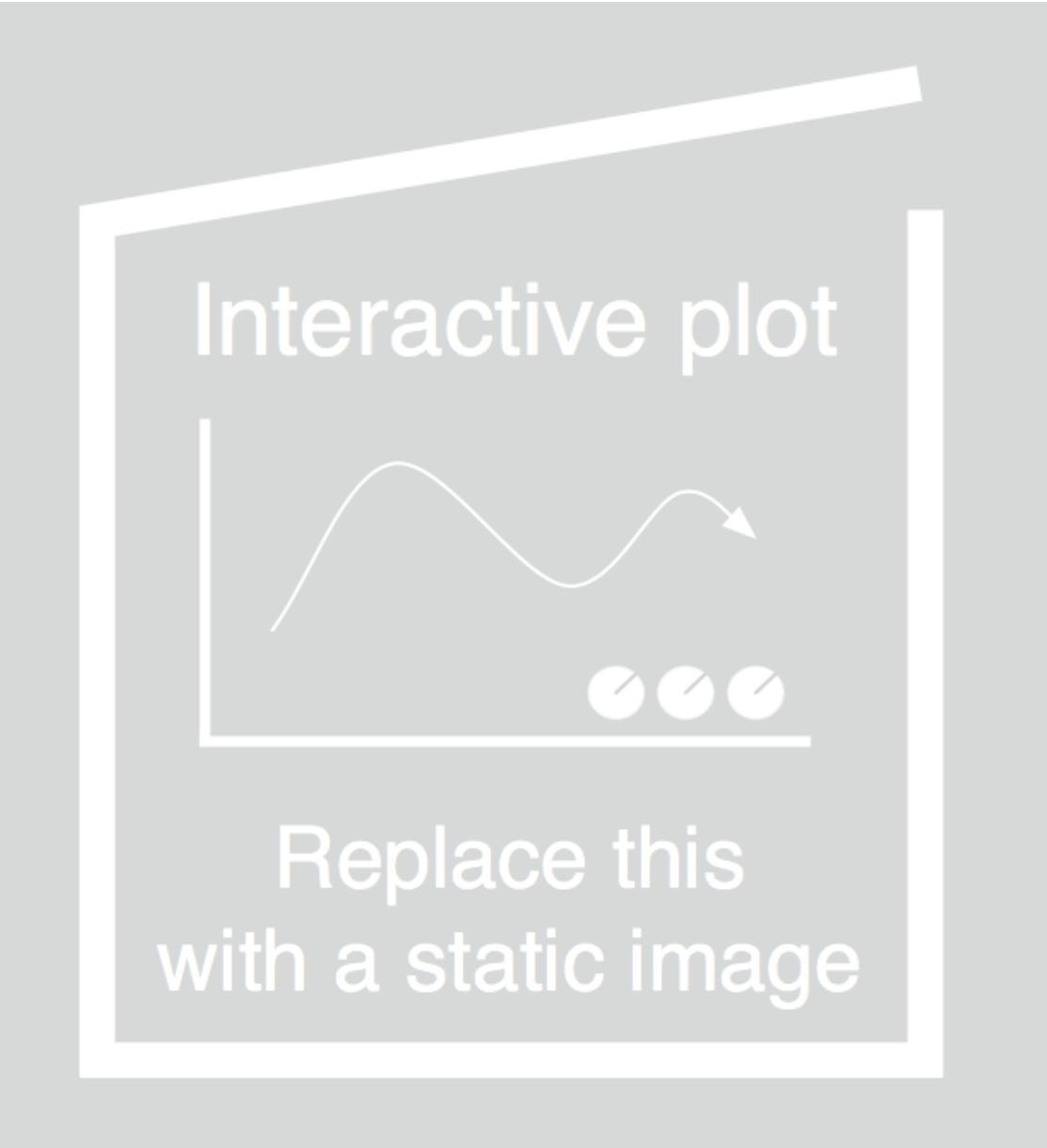
Figure 10: Number of submitted articles per NIH subdomain per WOL Level 2 category.