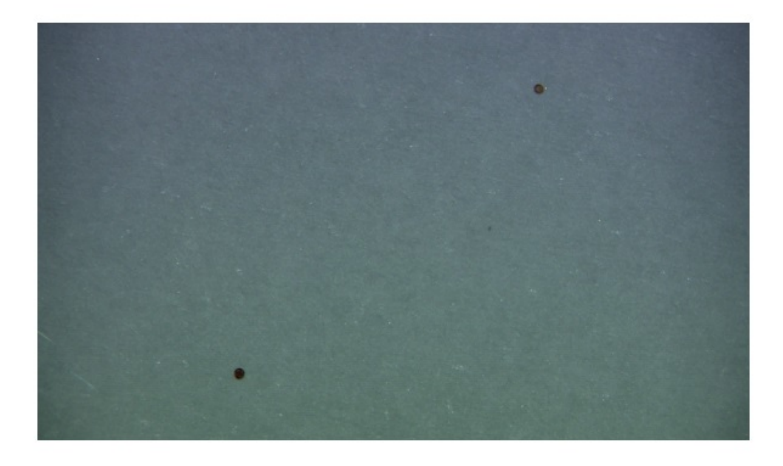
Figure 2: This is a caption

Two blood-stained droplets viewed under surgical microscope at 7.8x magnification.