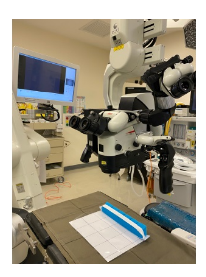
Figure 1: This is a caption

Face shield placed on white background with grid prior to droplet count with surgical microscope.