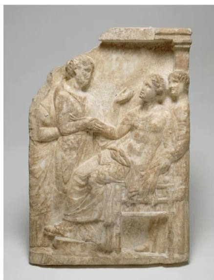
Figure 4: Attic grave relief depicting a woman dying in childbirth, dating back to 330 BC; it is housed in Harvard Art Museums. It is made of pentelic marble, which was often employed to create most monuments in Classical Athens.