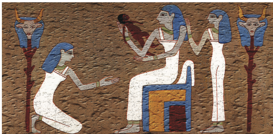
Figure 3: Painting by Jennifer Wegner, reconstructing Side A of the birthing brick found in South Abydos, portraying the mother, child, and two Hathors. It is a decorated mud brick that was found only partially intact.