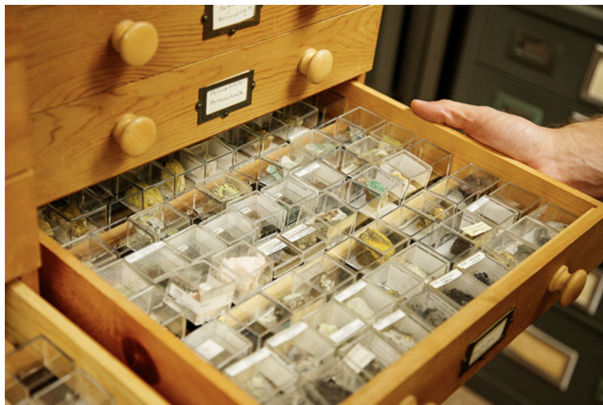
Figure 1: A researcher accessing parts of the mineral collection at NHMLA. Our collection can be search at https://collections.nhm.org/mineral-sciences/

When it comes to unlocking the museum's mineral collection, what we are talking about is accessibility, and are there only two groups of people to which this mainly concerns. They are the professional researchers and the general public.