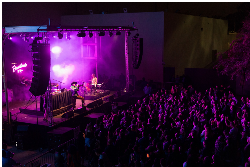
Figure 6: Typical First Fridays concert at NHMLA. Can you see me in the crowd? First Fridays has food, drinks, scientists, discussion panels, tours, concerts, and everything else to have fun and make people feel comfortable. All the while being as educational as possible.

and education. The community also feels safe in sharing ideas and opinions at a museum. There is space to have fun and share new experiences: First Fridays, Bug Fair, Dino Fest, Summer Nights, playful gardens, traveling exhibits, weddings, proms, nights at the museum, summer camps, and many other activities that make a museum a magical place.