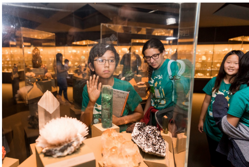
Figure 2: A visitor looks as if they want access to this part of the mineral collection.

Public. This group is limited to viewing selected specimens that the museum deems vital for the exhibit. The level of scientific information that is conveyed to the public is often limited in scope (or out of date soon after exhibit installation), and the degree of information given to illustrate the importance of the collection is often omitted. In general, this group of people cannot physically access the collection, nor can they see the vast collections that museums house. A critical issue to address is that they don't understand why we need collections in the first place.