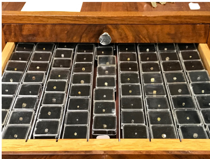
Figure 3: An example of the diamond reference drawers at NHMLA. Each one of these small plastic boxes holds a single diamond of known origin.

Get Access Now. The museum also houses otherwise inaccessible material. For example, maybe a researcher wants to compare minerals that are included in diamonds from South Africa to those from Brazil. It may be possible for that researcher to: 1) Visit these remote places, somehow gain access to the mines, broker a deal to take the diamonds (at a price), get through customs, and hope that the minerals obtained possess interesting inclusions. Or, 2) go to a museum, search the curated diamond collection for South Africa and Brazil specimens, select the mines of interest, get preliminary data on all potential minerals to ensure usability, and borrow specimens for further investigation. The second option is far simpler and more efficient, and obviously, this scenario can be applied to other mineral research projects. I also realize that not everyone can afford to go to a museum, and we are trying different things to solve this problem . Of course there is value in the first option, but it is less accessible option to most people.