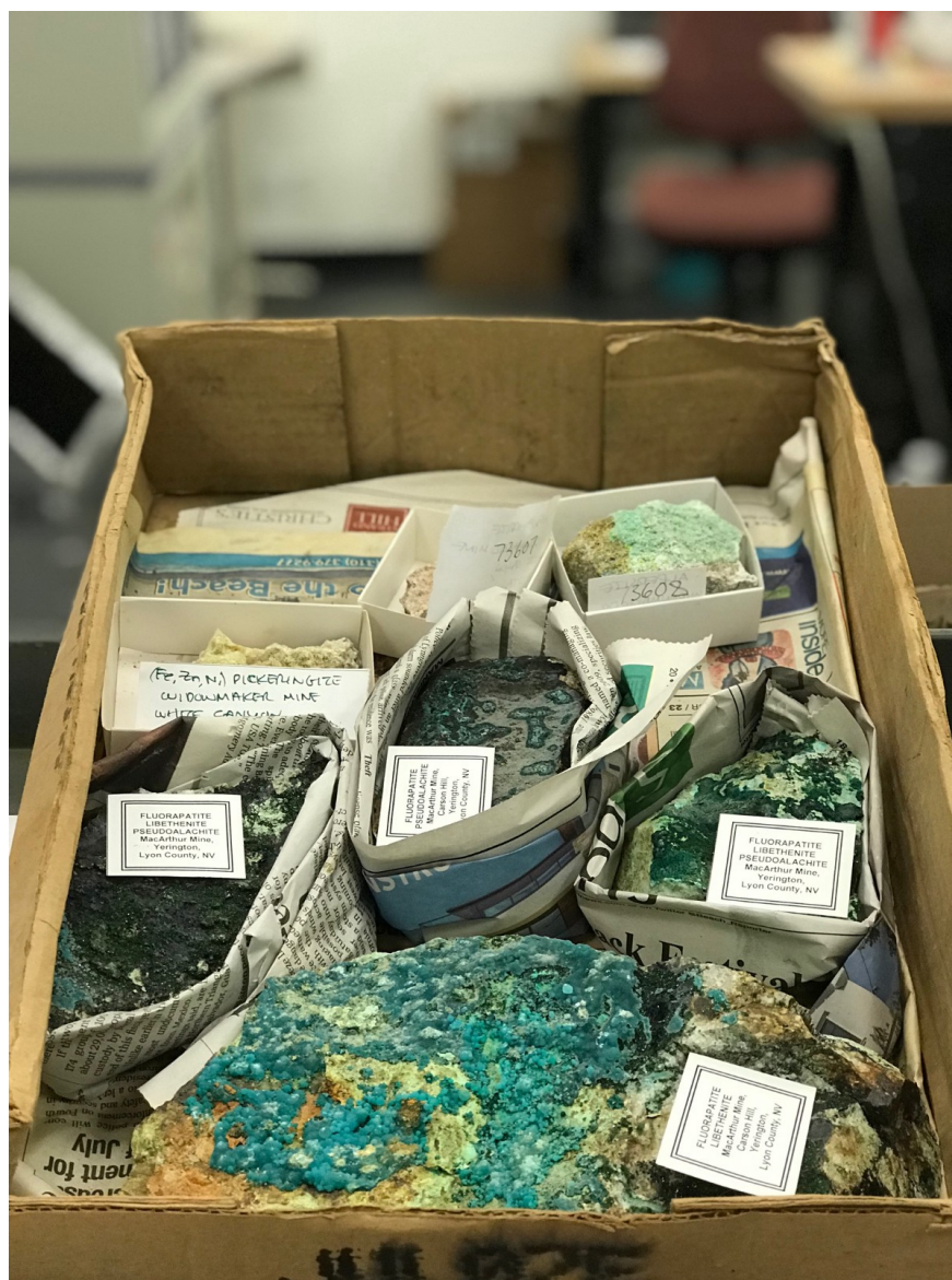
Figure 8: Typical type of donation we receive. This is representative material from the MacArthur Mine in Nevada. These minerals will be cataloged, photographed, and then immediately available for search on our database.

The Importance of Collections. A mineral collection provides a consolidated resource for research and education. Even when field sites become mined out, built over because of construction projects, or altered because of environmental changes, the collections will endure. But the collection can be used to engage people on many levels including education programming, summer camps, accessible public lectures, public programs, volunteer programs, docent programs, audio tours, exhibits accessible to the impaired, co-created exhibitions, social media, augmented reality, expeditions, and traveling exhibits. In addition, online content and interactions are getting richer, more accessible, and easier to implement all the time. Each one of the listed items above would be a blog post on its own about how mineral collections can be integrated into those outreach aspects. But in the end, a museum can do all/some of these, or none of these. There are a