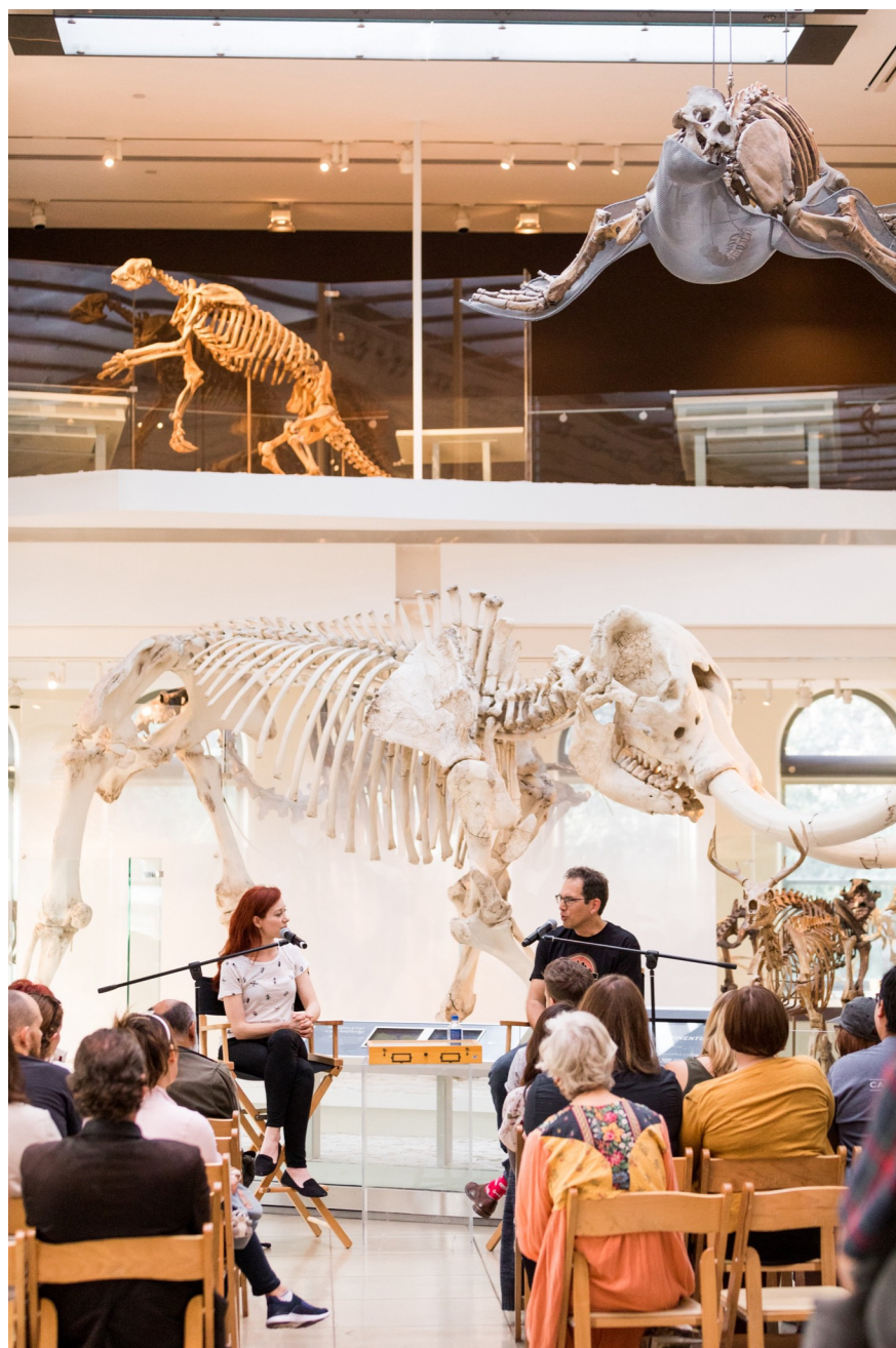
Figure 7: I The community is welcome at NHMLA panel discussions.