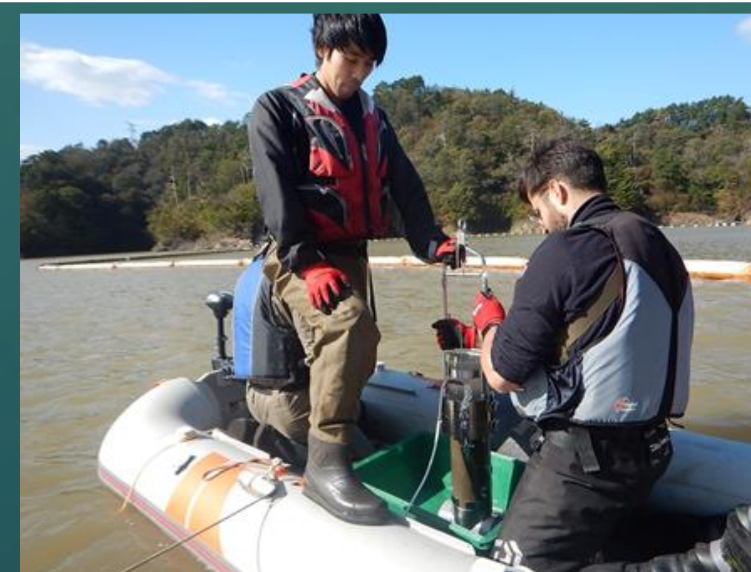
Soil and bottom sediments core sampling at Glubokoe, Azbuchin lakes and Cooling Pond at Chernobyl and at Ogaki dam at FDNPP exclusion zone