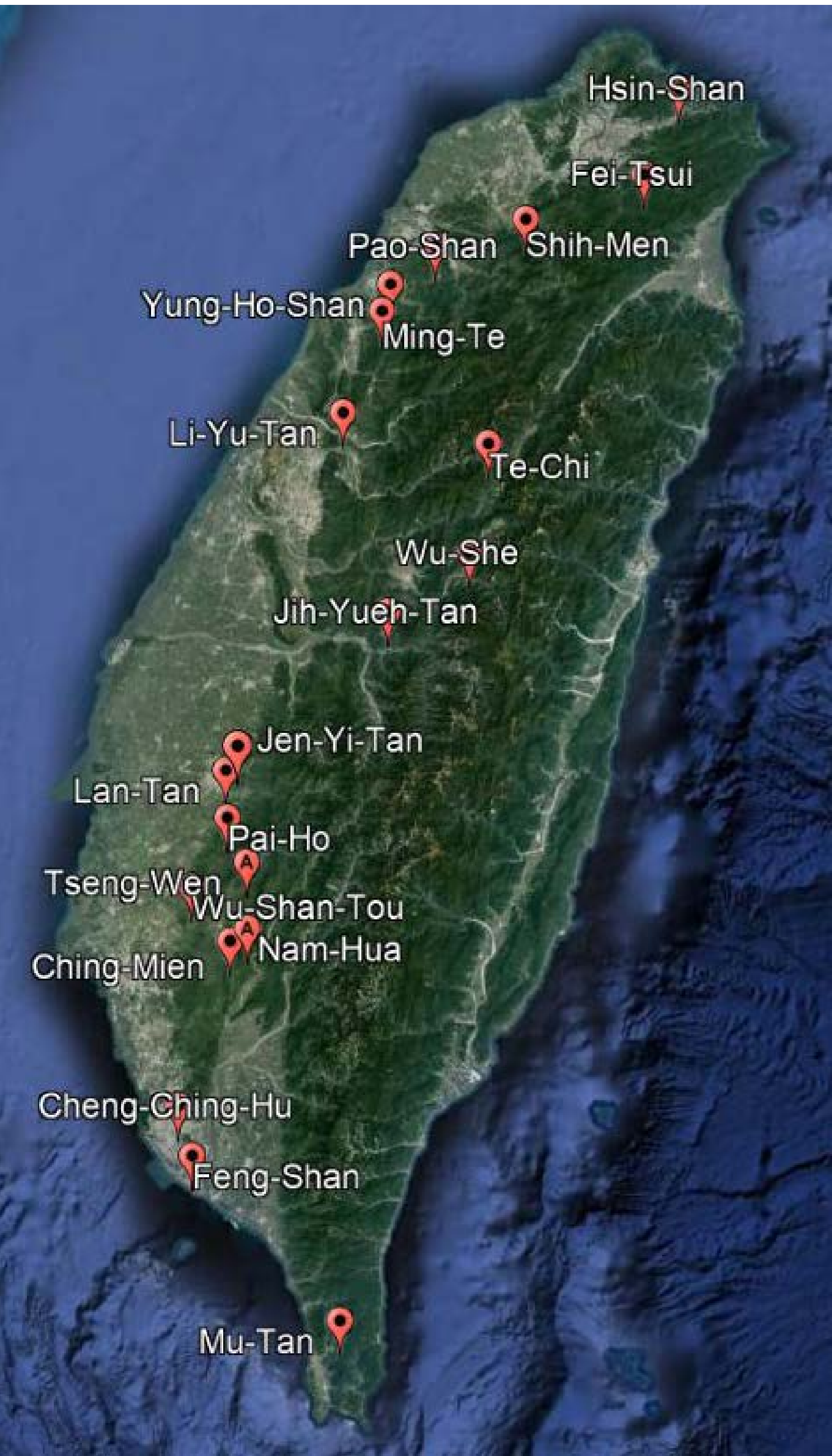
Geographical locations of reservoirs